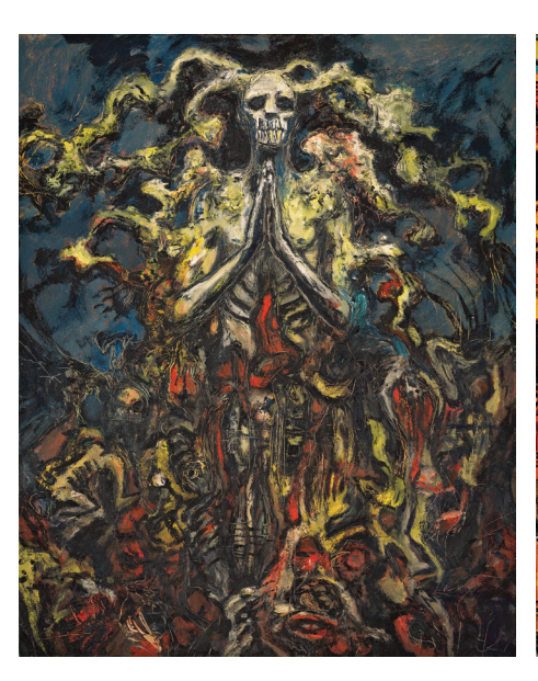
TARRIE CAT ARMY