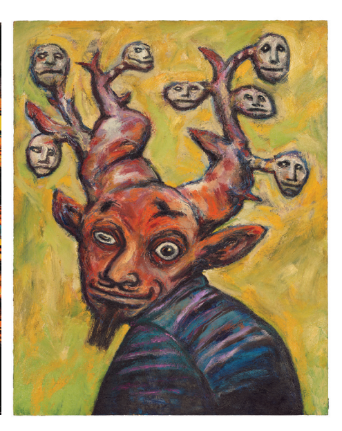
ATHE CLIVE BARKER RCHIVE